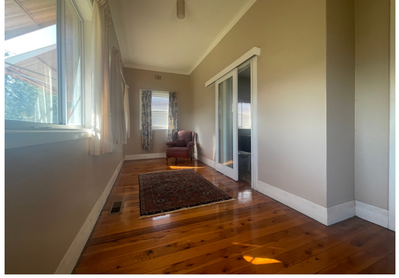
56 DIGILAH STREET, DUNEDOO | 2 🗎 1 🖨 3 🖨 | 986M2

56 Digilah Street, a charming double brick home boasting two large bedrooms with adjoining sunrooms allowing ample room for both relaxion and productivity. A perfectly positioned north facing home, looking over the Talbragar River flats, close to schools and main street, this home is where opportunity meets potential!